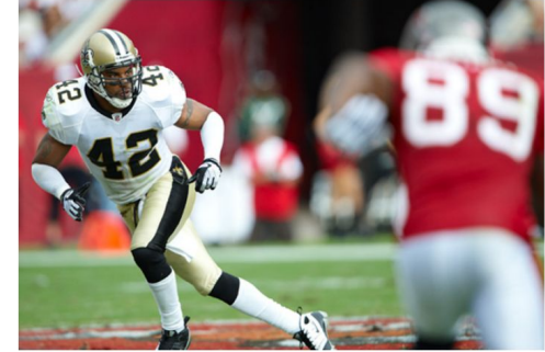
Darren Sharper in action against the Tampa Bay Buccaneers in 2009.