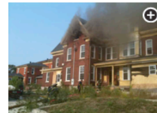
Firefighters work the scene of a fire Thursday afternoon at Fifth and Maple.