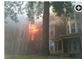
Fire at Fifth and Maple on Thursday, Aug. 16, 2012.