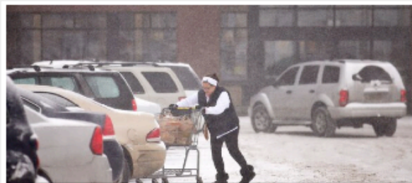
PHOTO SHOWCASE: Omaha braces the cold and snowy weather - http://odc.omaha.com/index.php?u_page=5002&p=4328 http://pic.twitter.com/OEDKaQsJiC