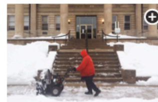
A worker uses a snowblower to clear the sidewalk in front of the Marion County Courthouse Tuesday in Hannibal, Mo.